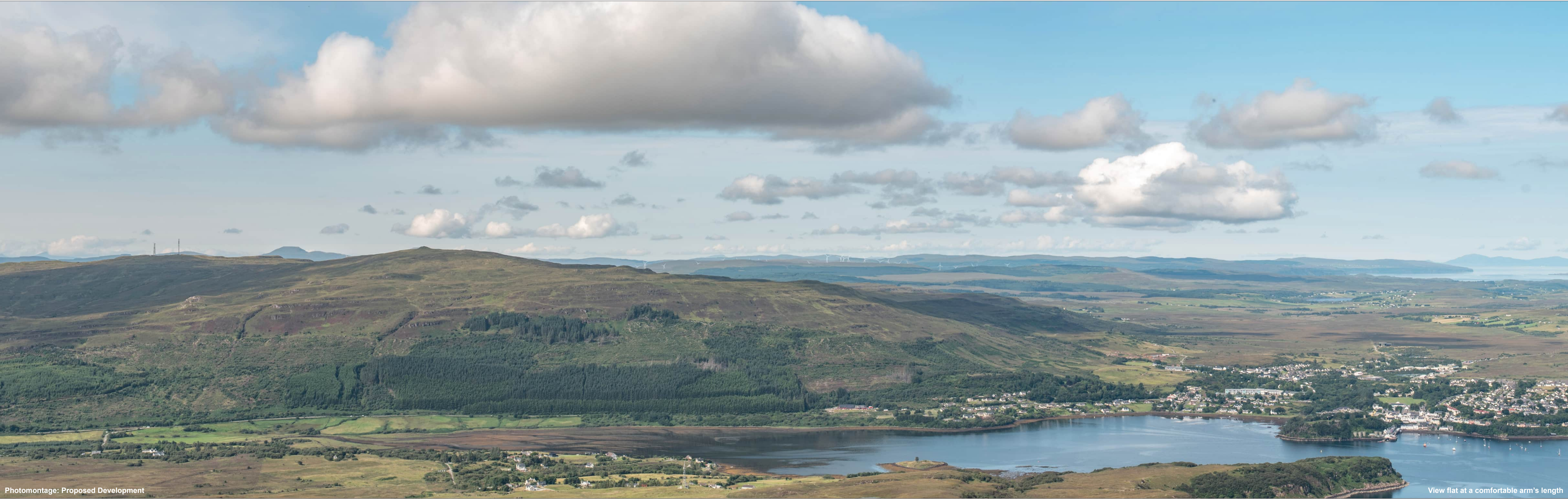
Photomontage: Proposed Development