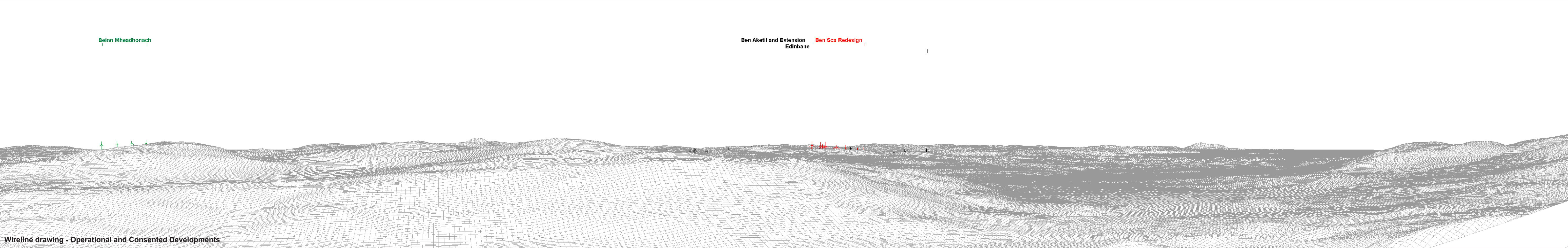
Wireline drawing - Operational and Consented Developments

This image provides landscape and visual context only