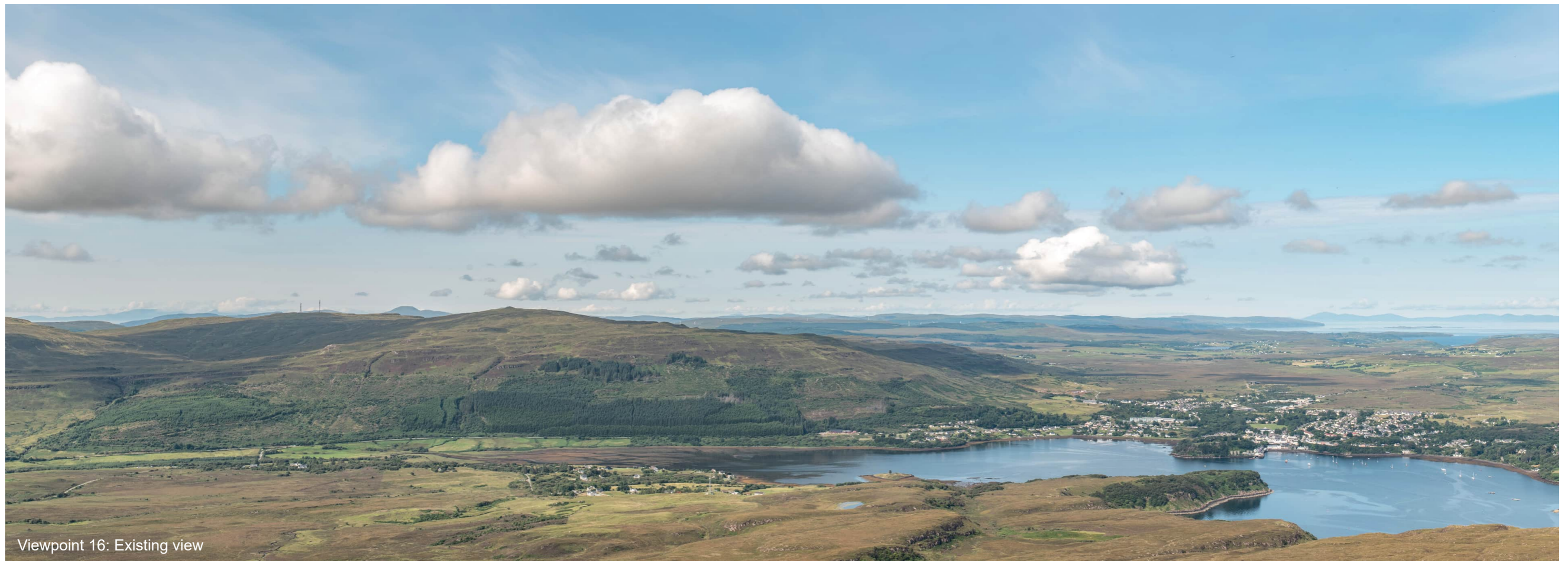
Viewpoint 16: Existing view