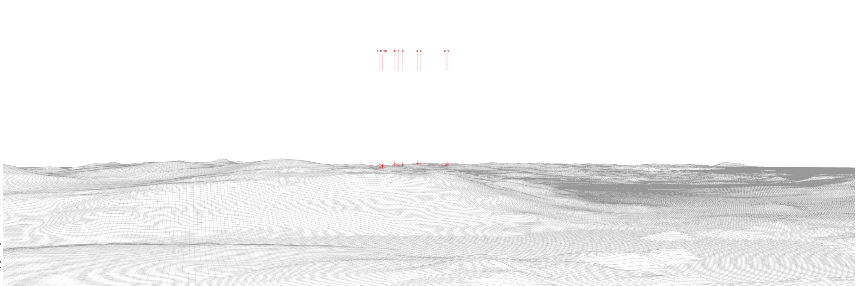
Viewpoint 16: Wireline overlay