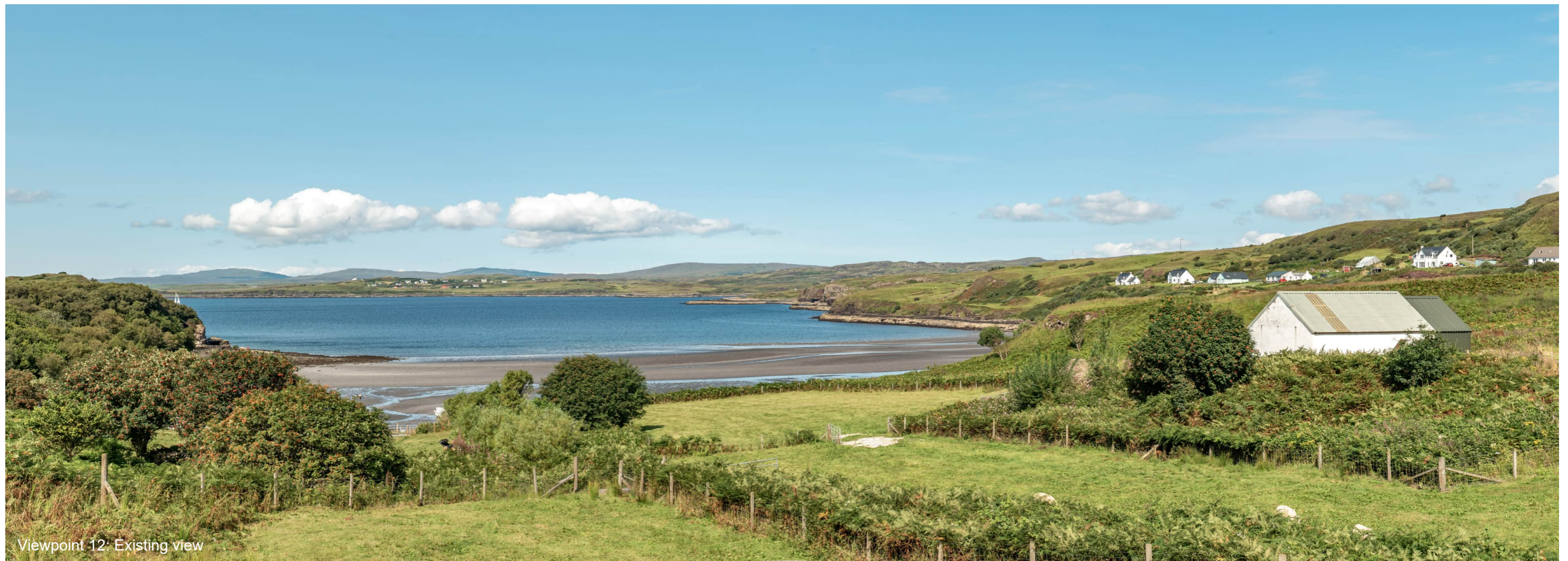
Viewpoint 12: Existing view