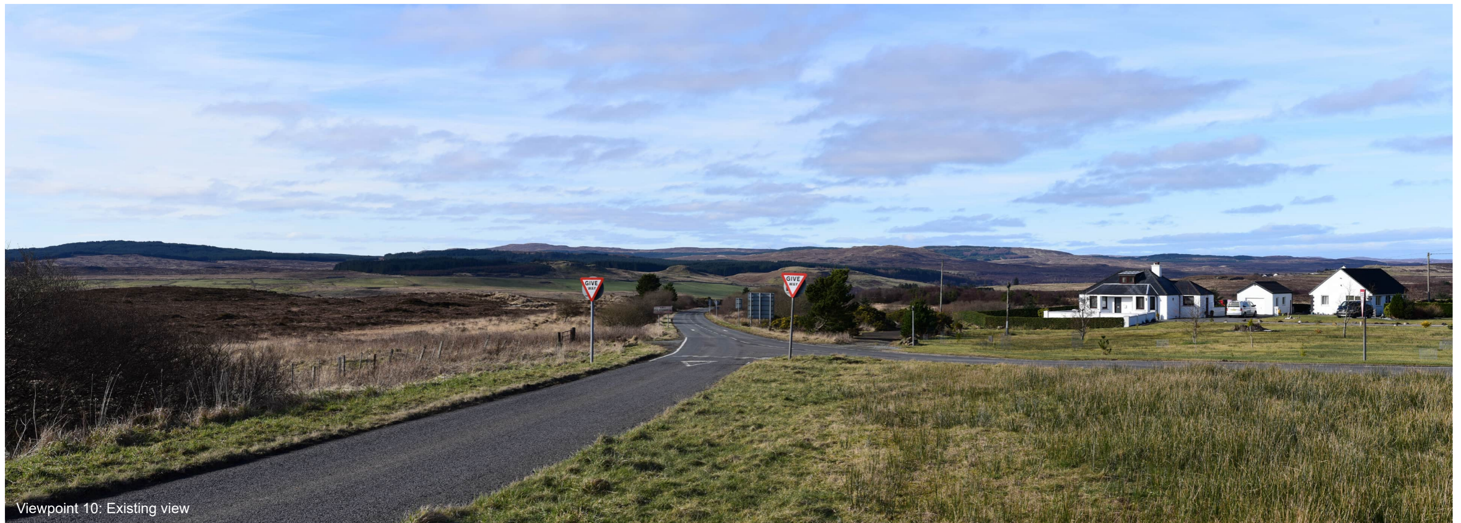
Viewpoint 10: Existing view