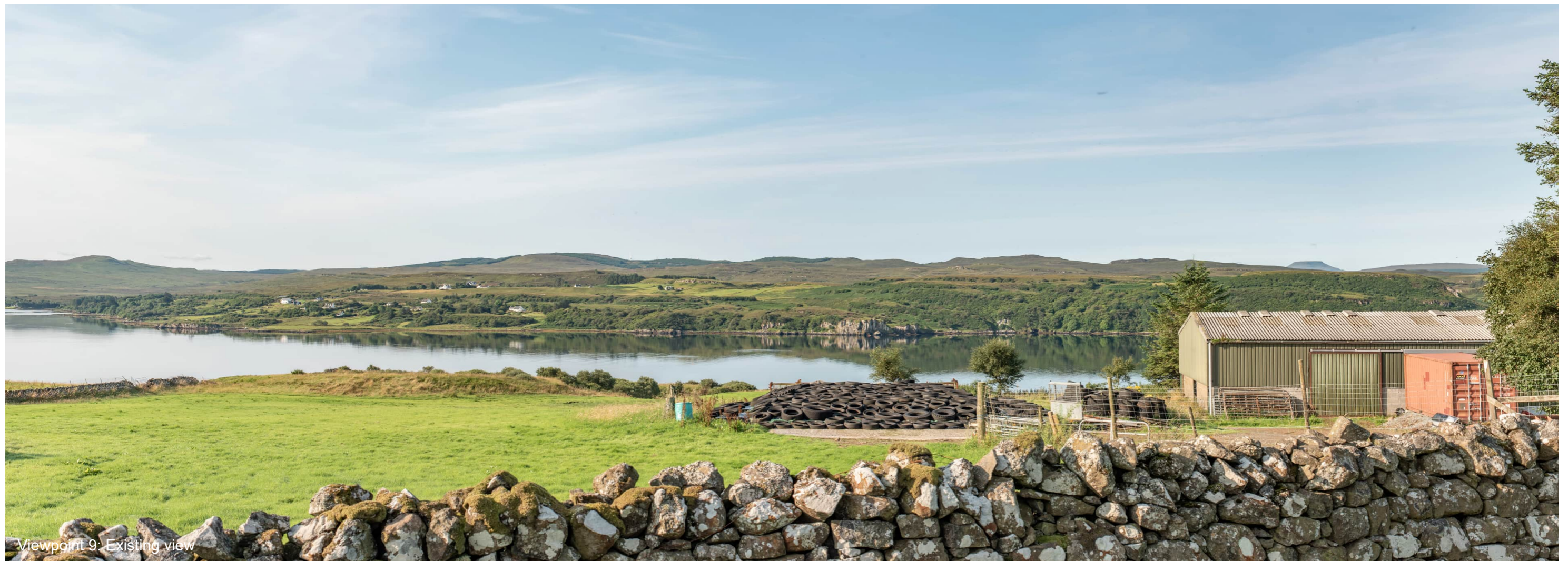
Viewpoint 9: Existing view