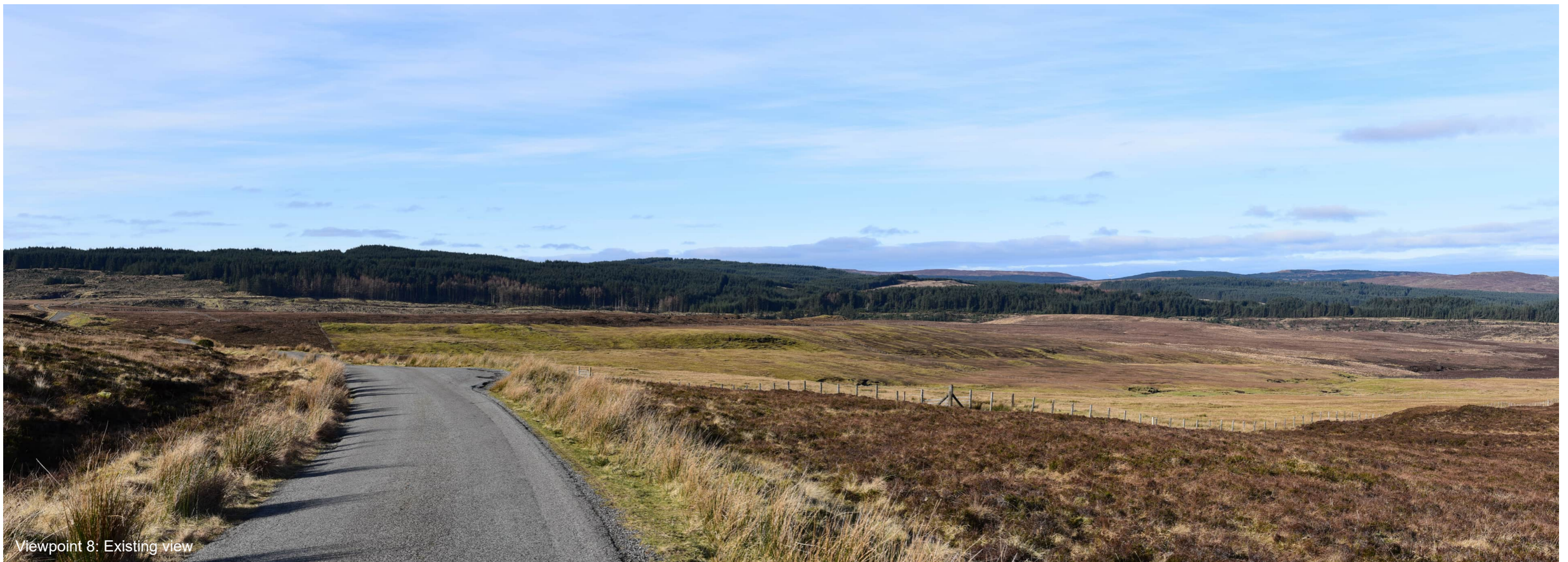
Viewpoint 8: Existing view