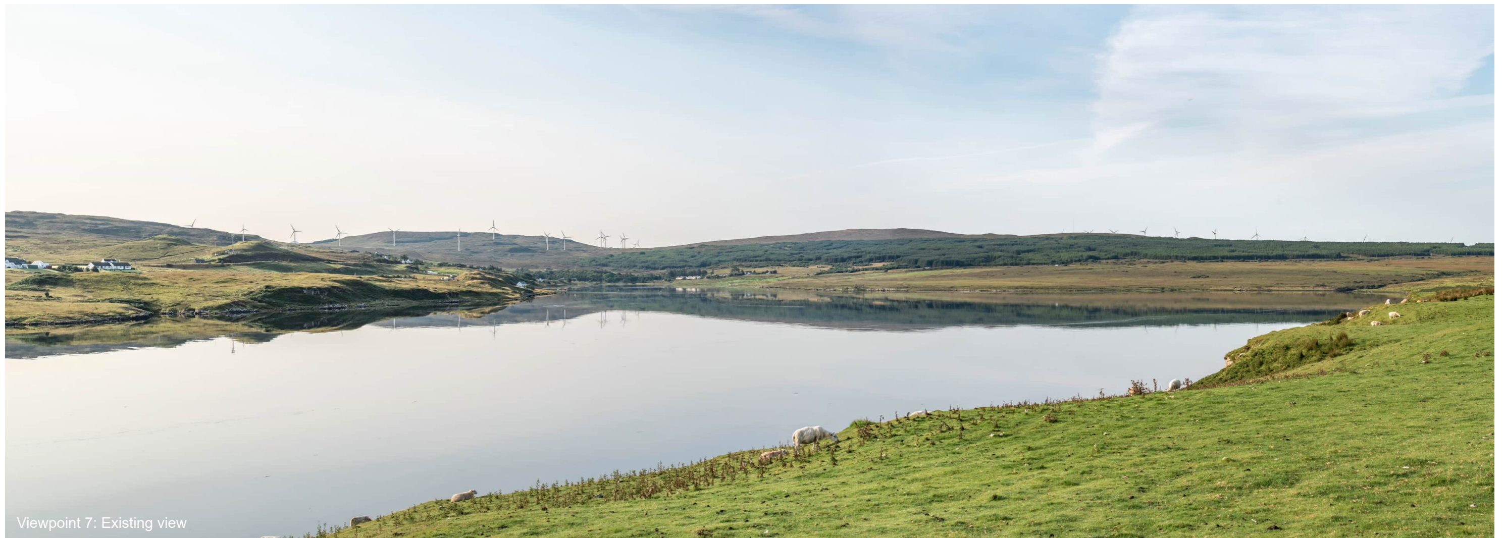
Viewpoint 7: Existing view