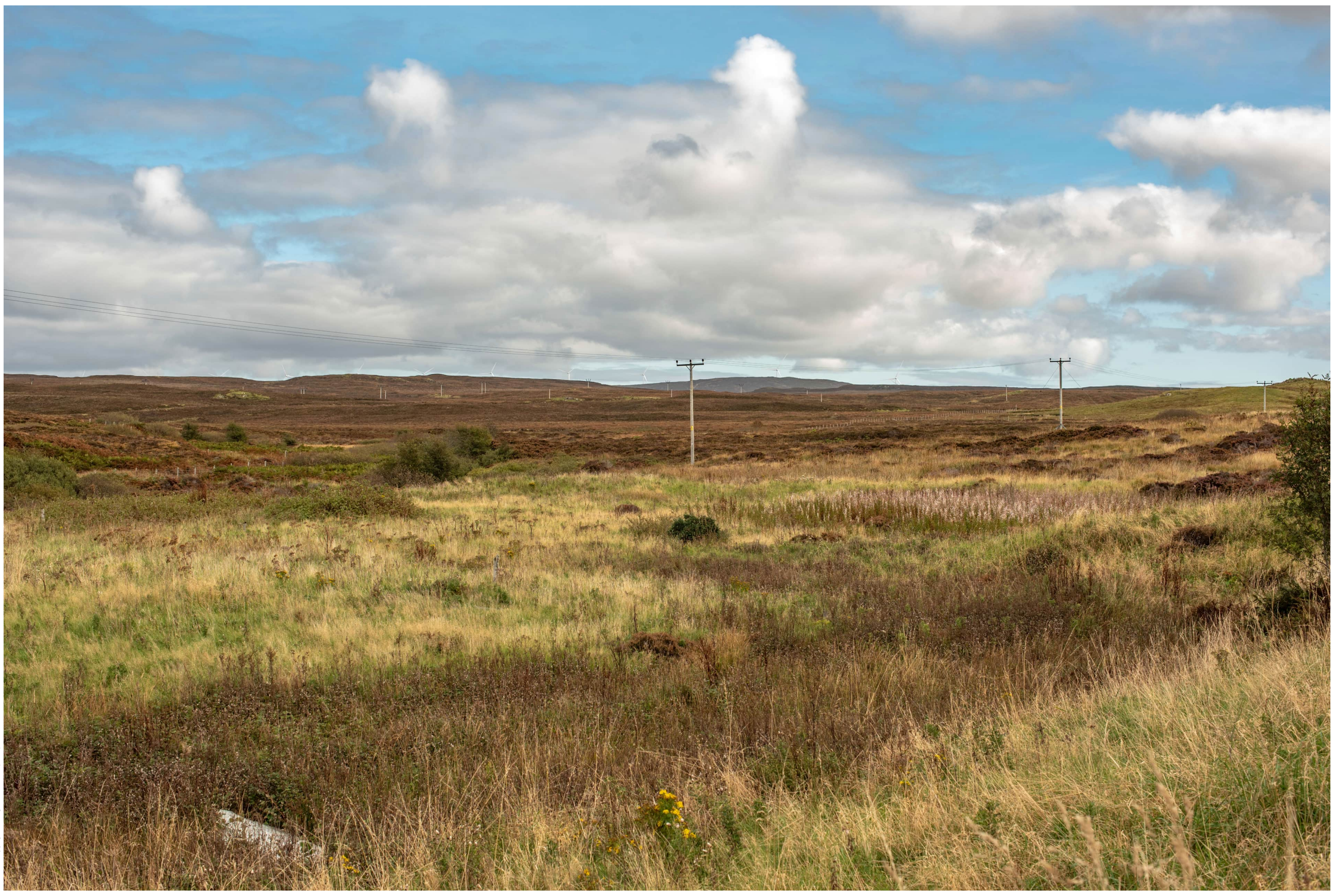
Viewpoint 6: Junction of A863 and B884 at Lonmore