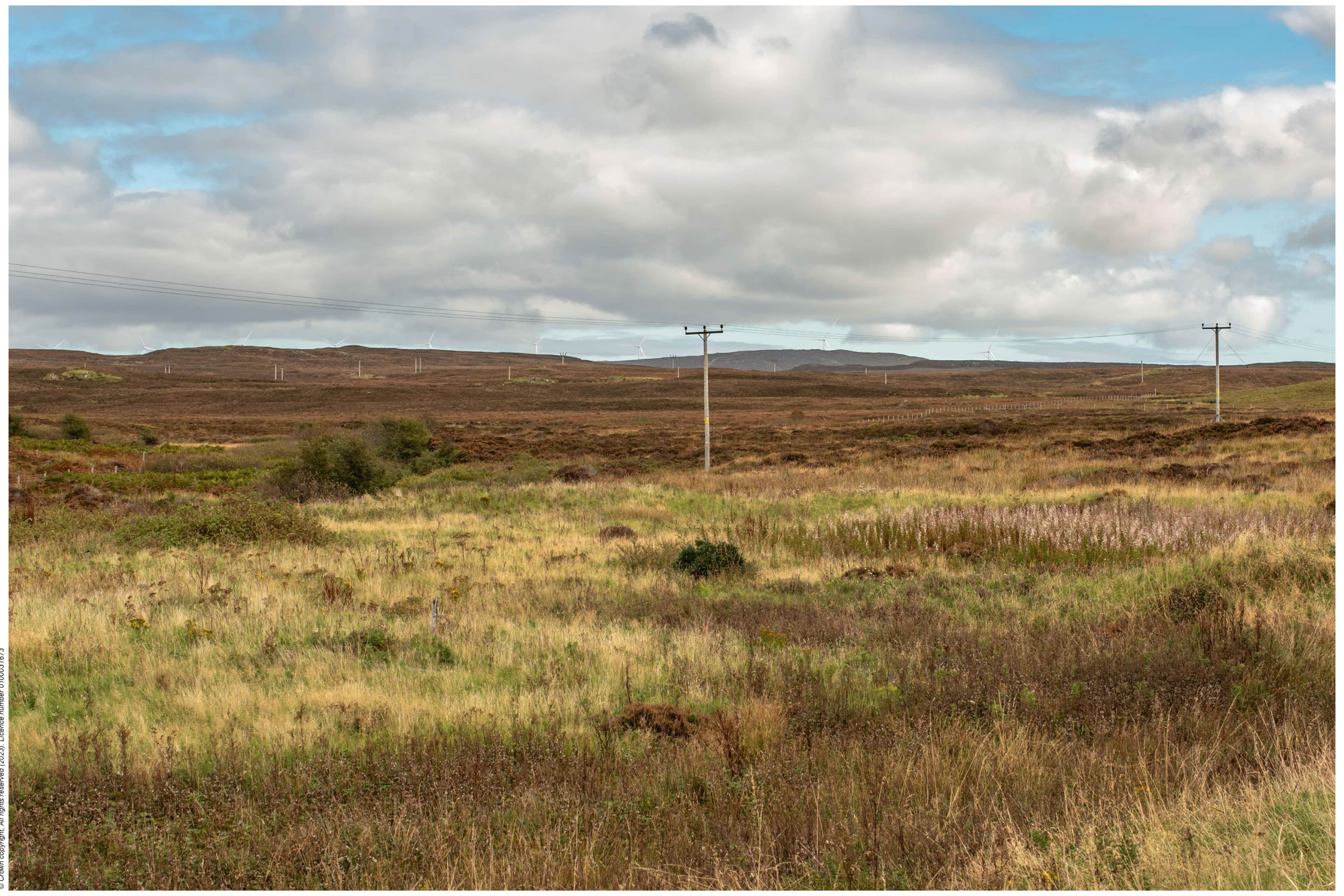
Viewpoint 6: Junction of A863 and B884 at Lonmore