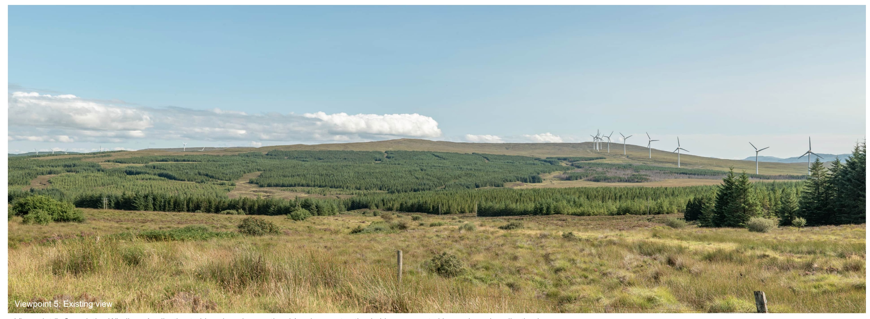
Viewpoint 5: Cumulative Wireline. Application turbines in red, operational / under construction in blue, consented in purple and application in orange.