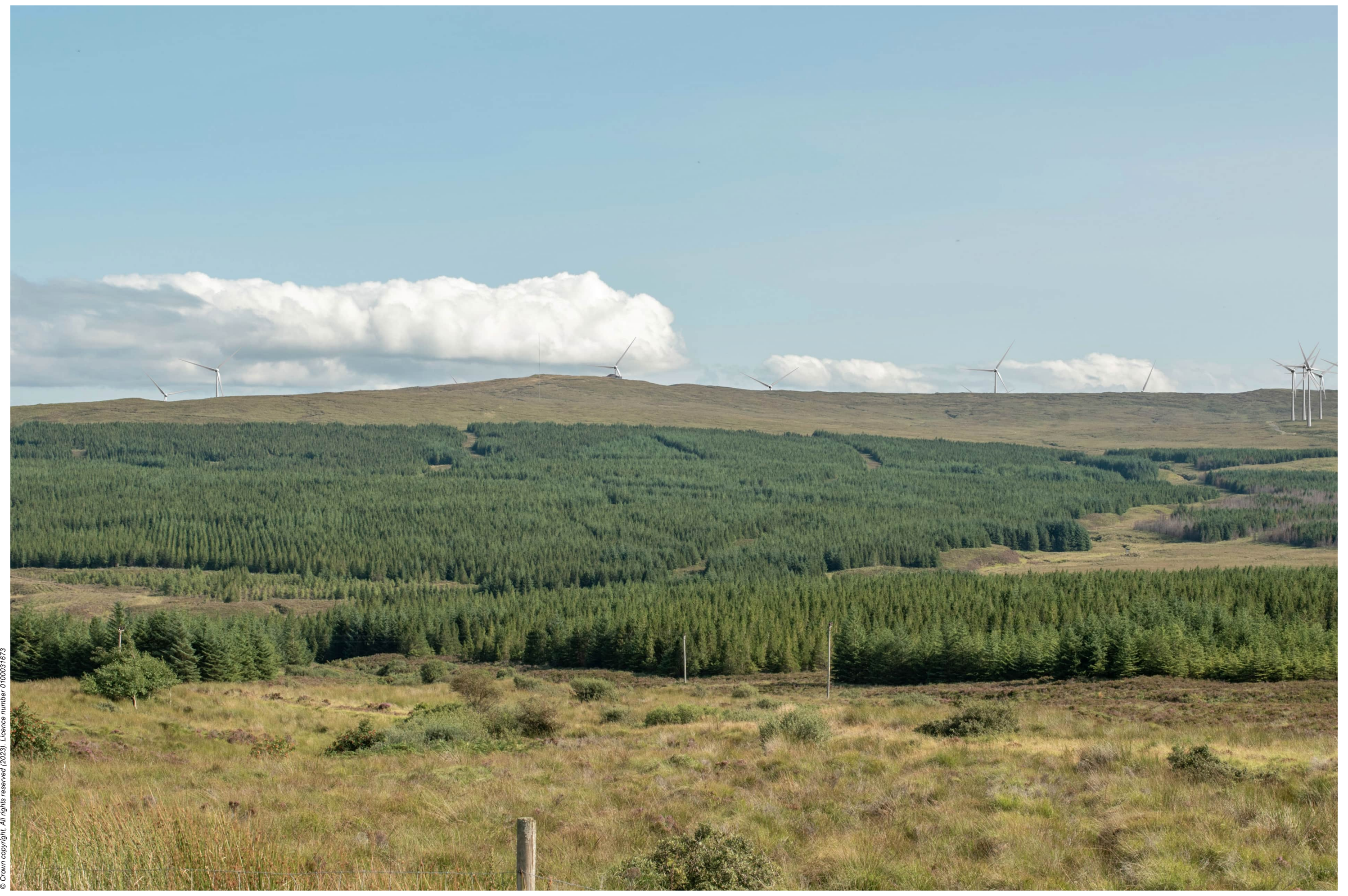
Viewpoint 5: A850 between Dunvegan and Edinbane (Balmeanach)