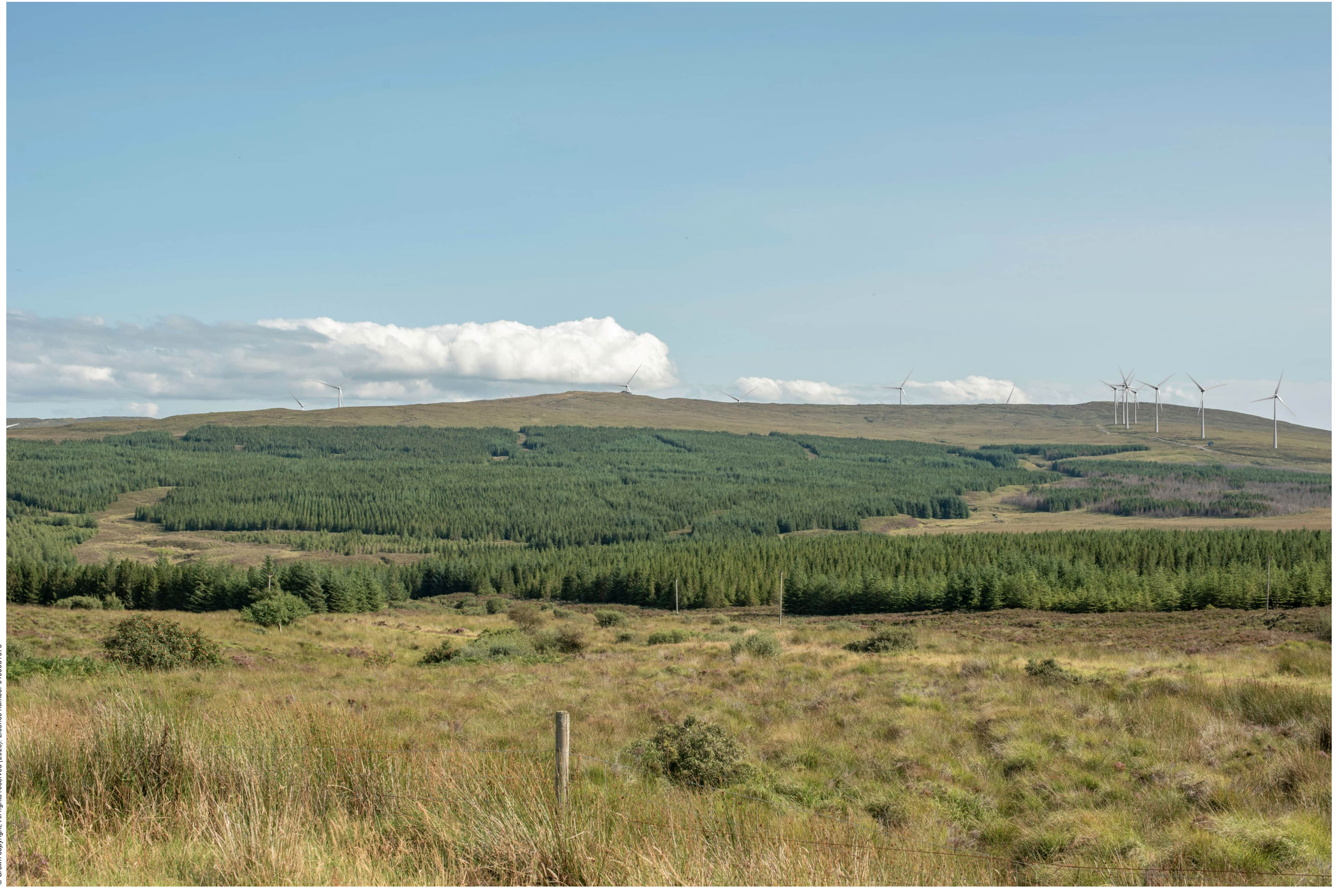
Viewpoint 5: A850 between Dunvegan and Edinbane (Balmeanach)