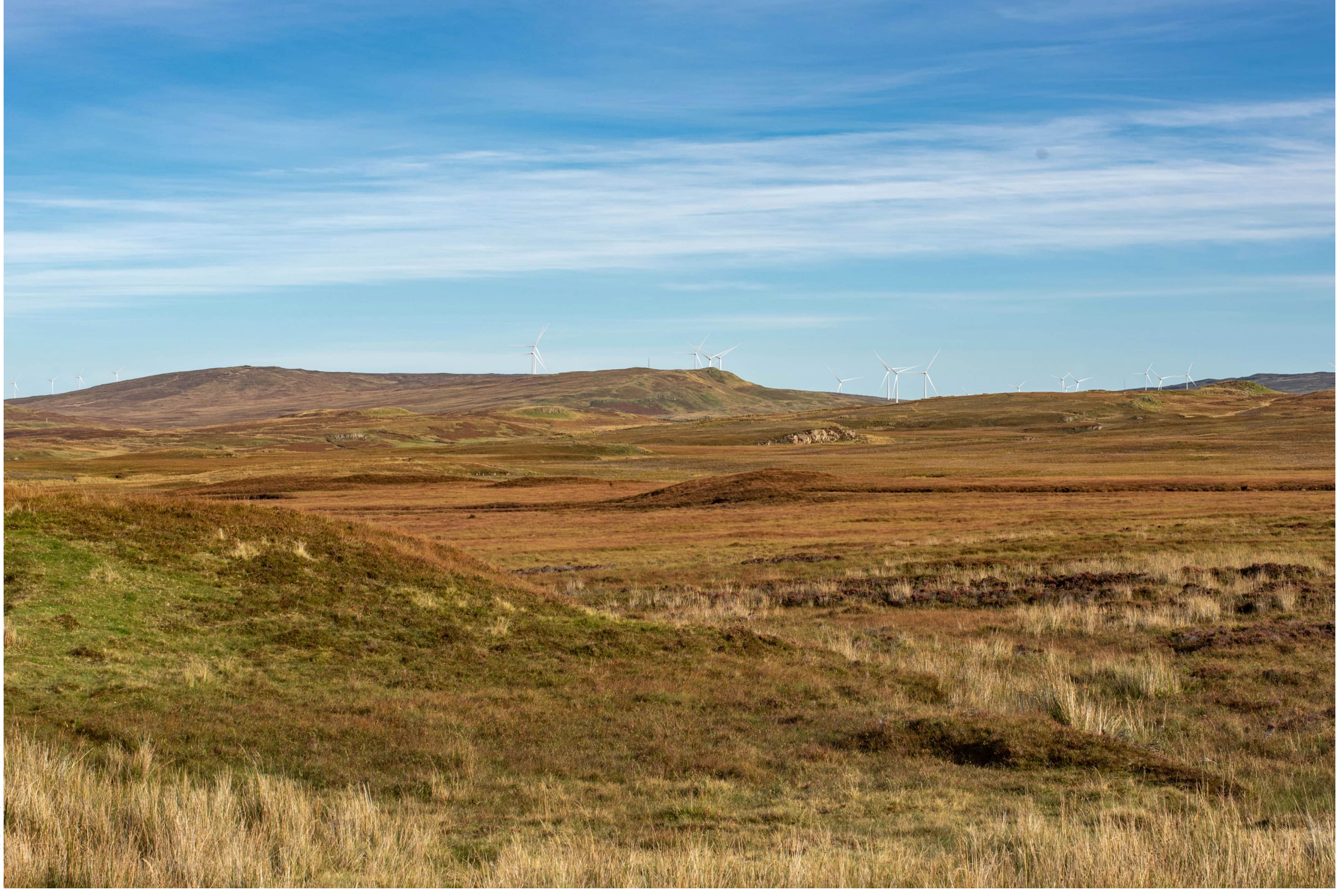
Viewpoint 3: A863 road near Gearymore