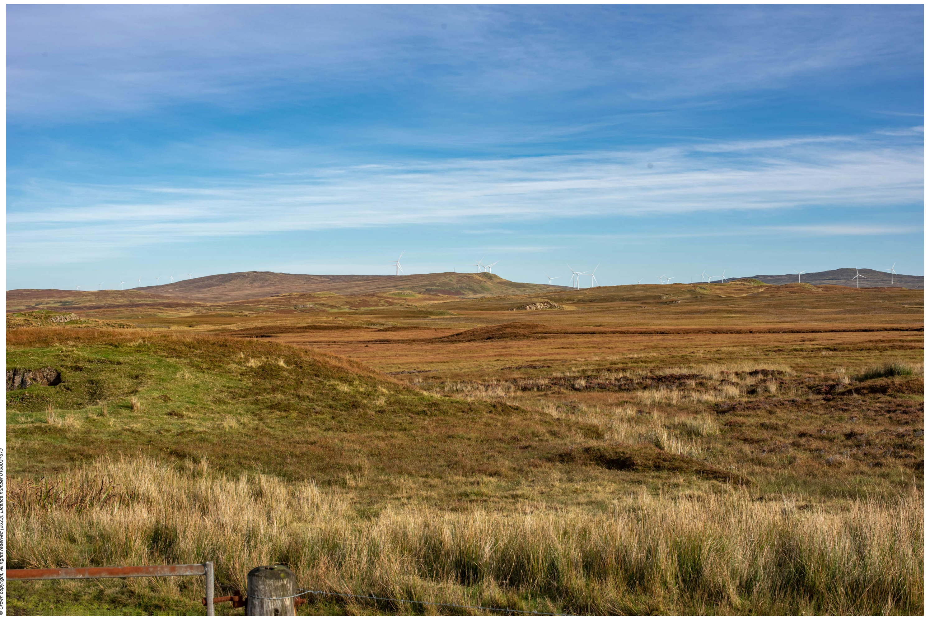
Viewpoint 3: A863 road near Gearymore