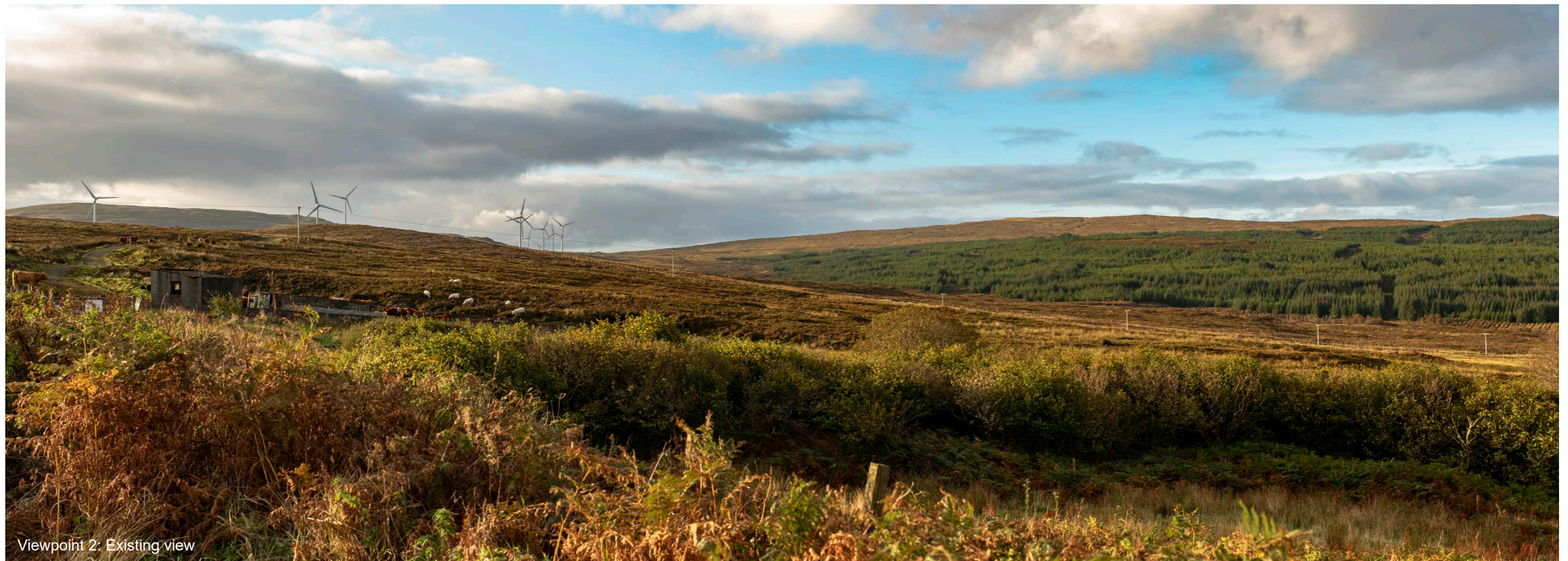
Viewpoint 2: Existing view