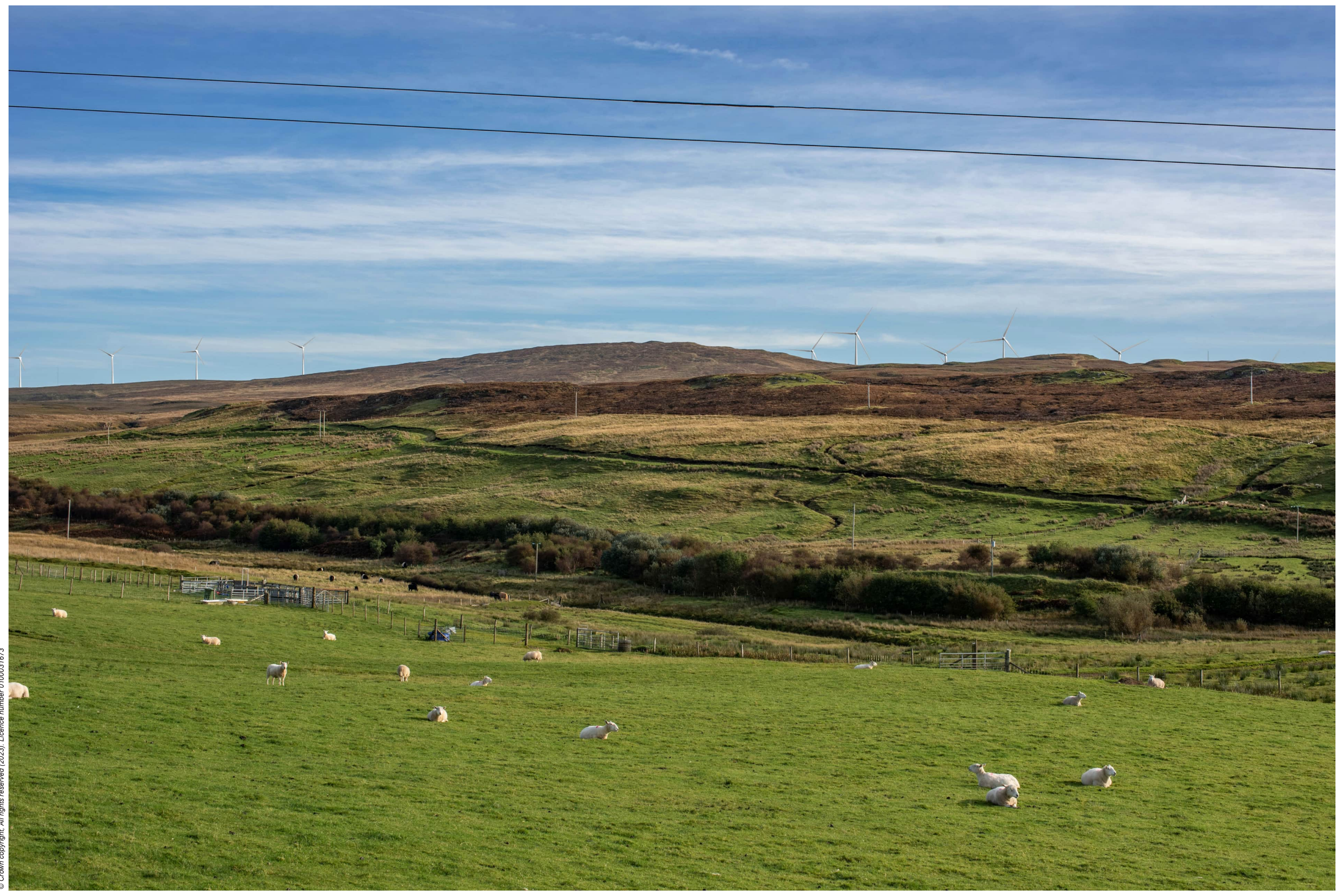
Viewpoint 1: A863, Junction with road to Feorlig