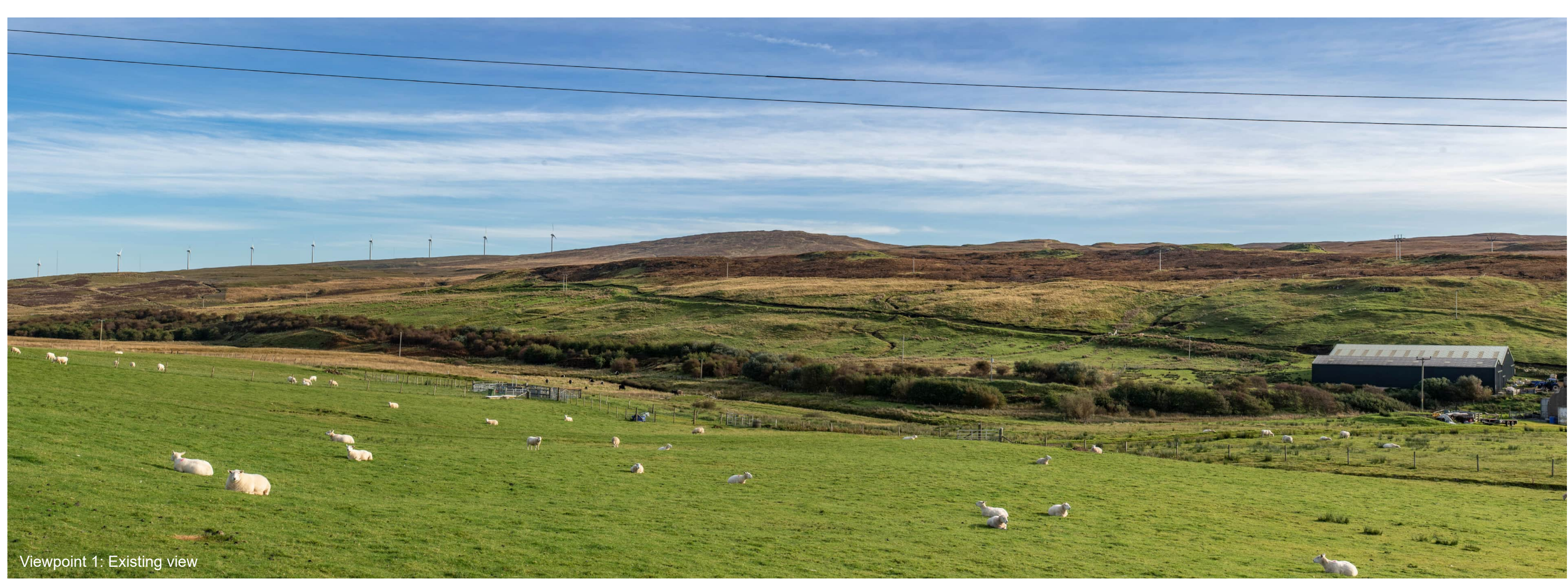
Viewpoint 1: Cumulative Wireline. Application turbines in red, operational / under construction in blue, consented in purple and application in orange.