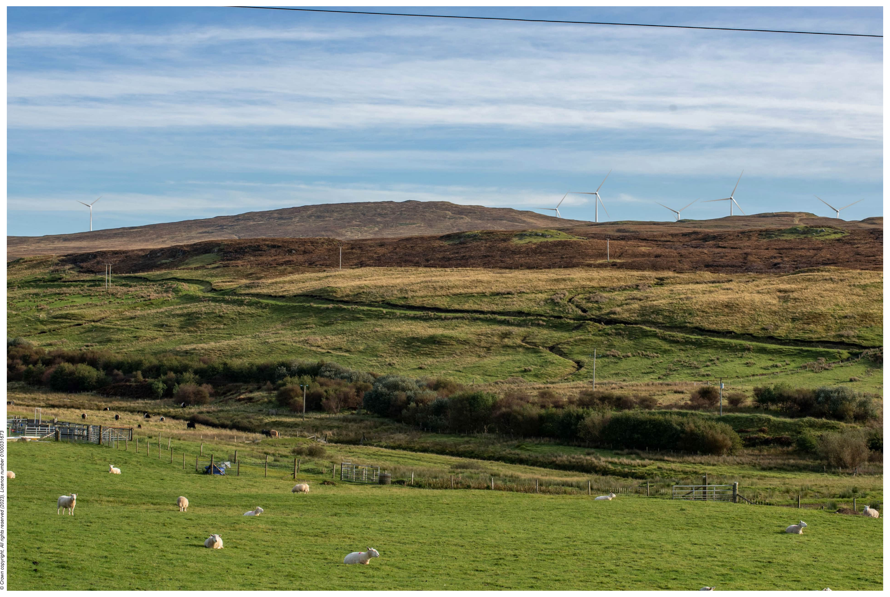
Viewpoint 1: A863, Junction with road to Feorlig