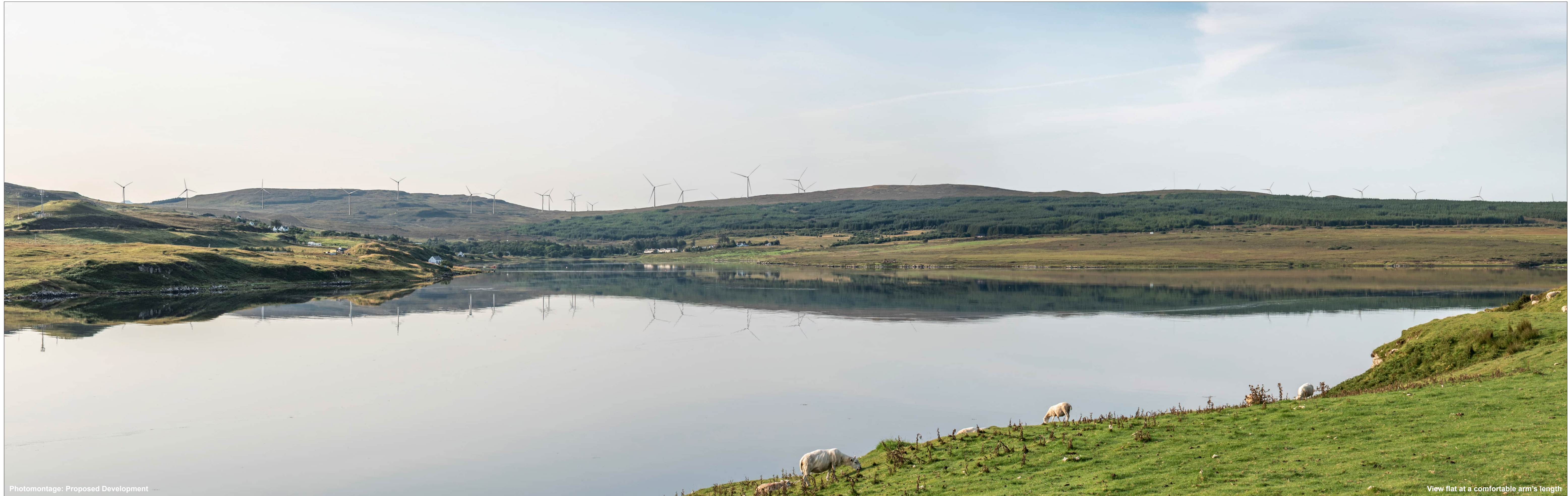
Photomontage: Proposed Development