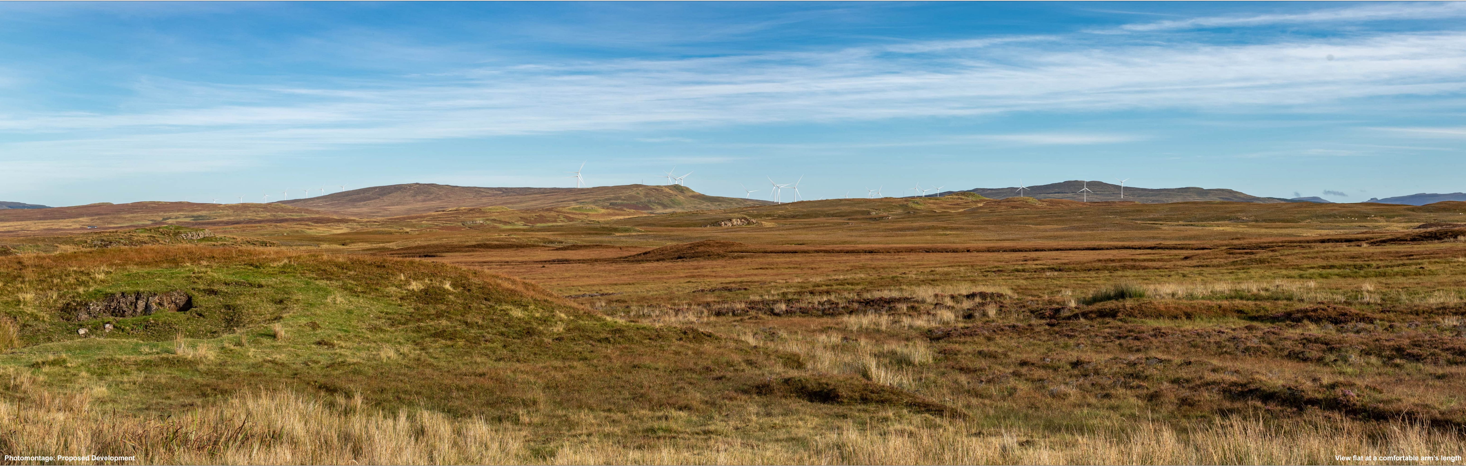
Photomontage: Proposed Development