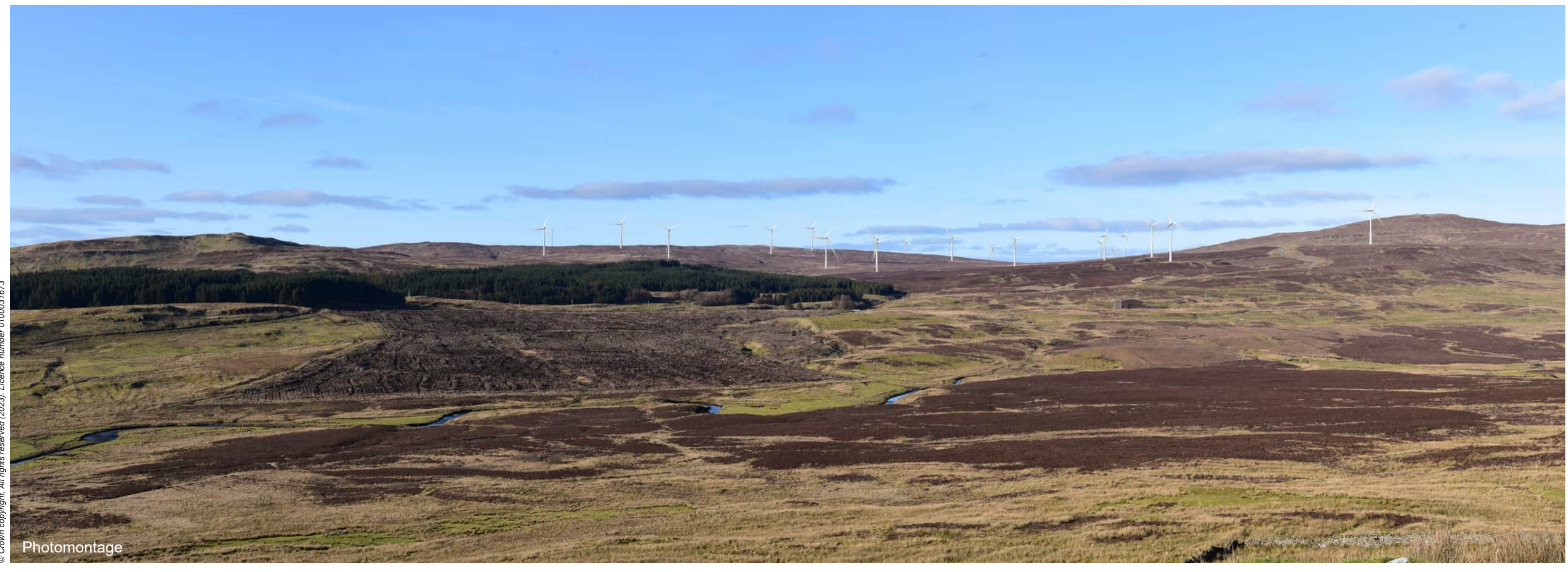
Viewpoint 2: Dun Arkaig Broch (SM13662)

Distance to nearest turbine: 3.18km Camera: Nikon Z 6II