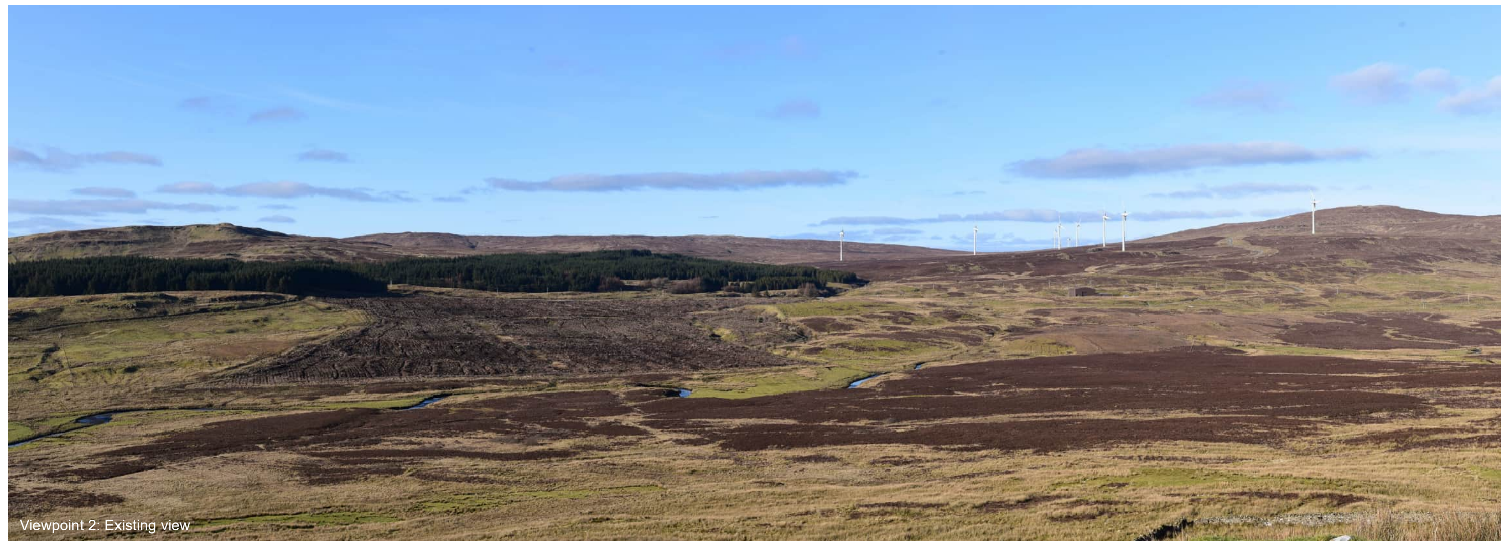
Viewpoint 2: Wireline overlay